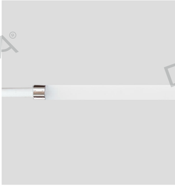
DPX-NF1213-TB (2) / DPX-NF1213-TB (3)